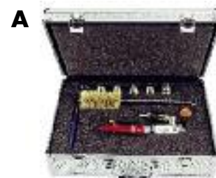
A Spray lance in alu box with 5 nozzles and tools