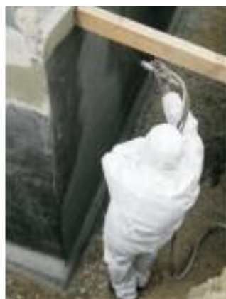
Water proofing bituminous / cementary

* Fillers like polystyrol, fibers, rubber granules – dep. on quality – please ask for our test reports