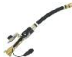
Automatic injection lance