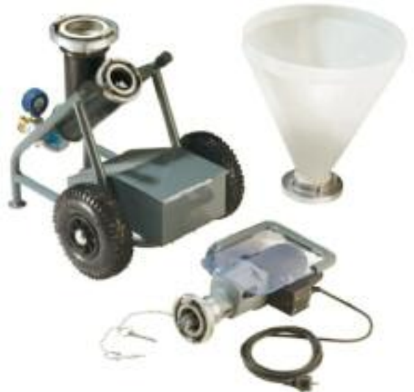
Demountable into 3 parts without tools