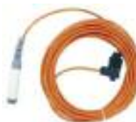
Remote control cable 15 / 25 mtr