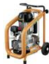
Compressor C330/3 230 V – oilfree