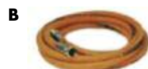
B Material hose 40 bar GEKA 1" – 3/4" – 1/2"