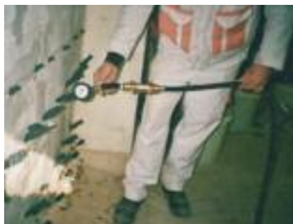
More step injection