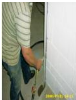
Door frame filling

Please pay always attention to the technical advises of material suppliers. Depending on material the maximum possible grain size could diversify. Please ask for our test reports.