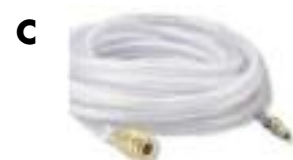
C Air hose 3/8" x 11 mtr quick coupling