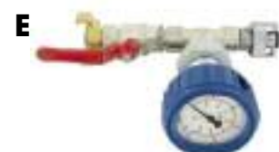
E Low pressure injection lance, safety gauge, manometer