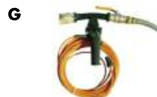
G Automatic filling gun