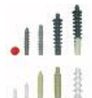
Low pressure injectors