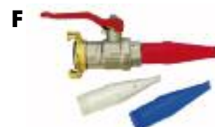
F Joint set with ball tap, 3 nozzles